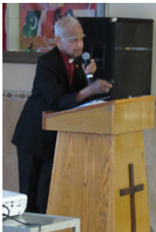
Archbishop Emeritus Lawrence Saldanha