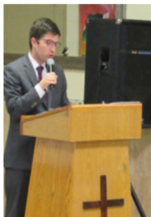
Mr. Garnett Genuis Conservative MP

shared the Conservative Party's vision for Refugee Sponsorship, and in particular the Private Sponsorship of Refugees Program.